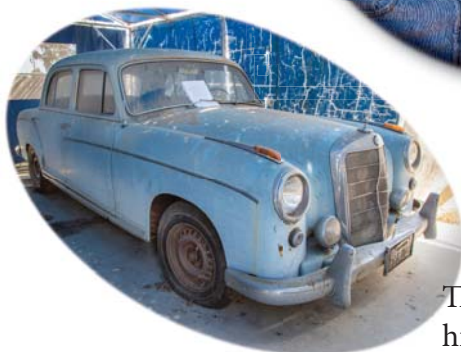
This 1959 Mercedes 220SE Sedan beauty was hidden in the back lot but deserves to be seen.