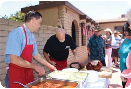
Once the food arrived...