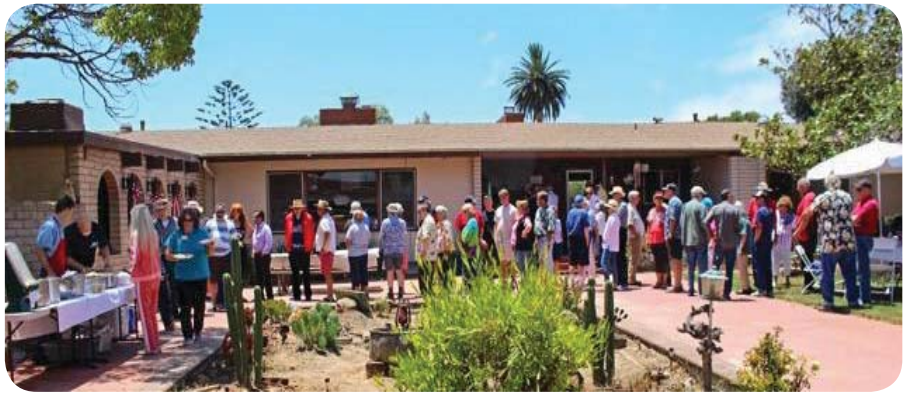
...the line grew quickly