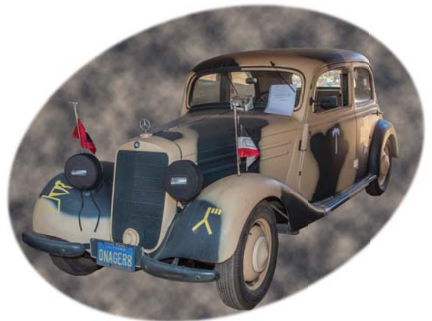
1951 Mercedes 170Da. This vehicle has been restored to represent a 1941 Afrika Korps staff car with the camouflage configuration and insignias. The upside down Y and the three bars signify the 4th Panzer Division. The other insignia is for Panzer Division Headquarters. The Palm Tree signifies the Afrika Korps