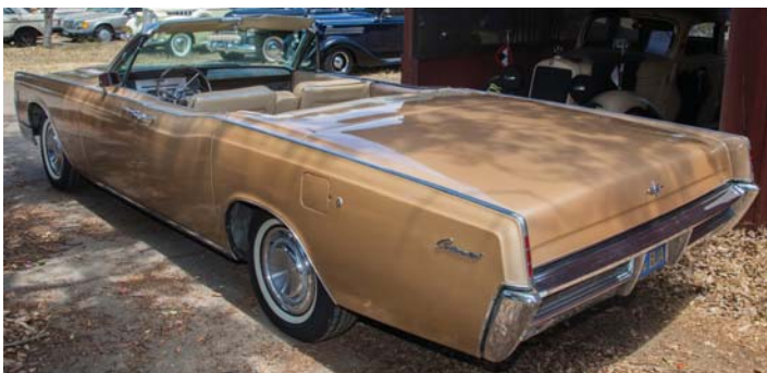
Al Smithson also brought this 1966 Lincoln Continental convertible