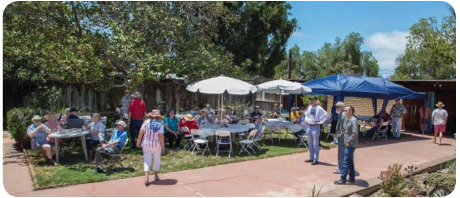
The seating was ample, spacious, and in the shade!