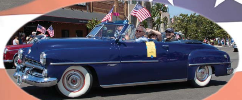
Nick Fintzelberg's 1951 Dodge Coronet convertible