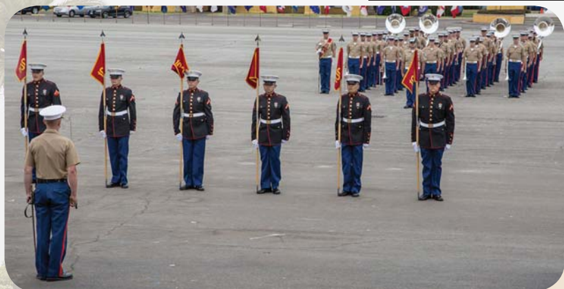
The Honor graduates from each of the 6 platoons. The young man on the left was the highest scoring graduate of all the recruits