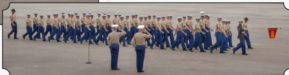
Review of one of the 6 Platoons