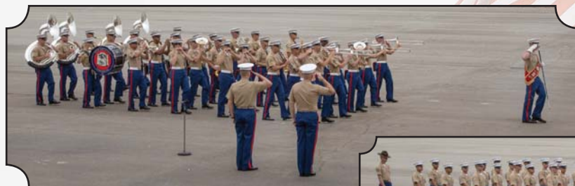
Review of the Marine Band

This was a great event and if it comes around again I encourage you to attend.