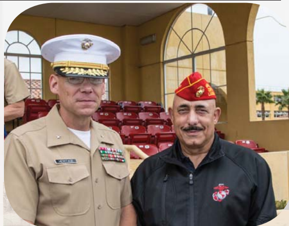
Brillo (right) with the new Commanding General Heritage