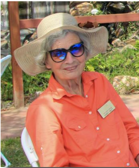
First Lady Sandy Watt