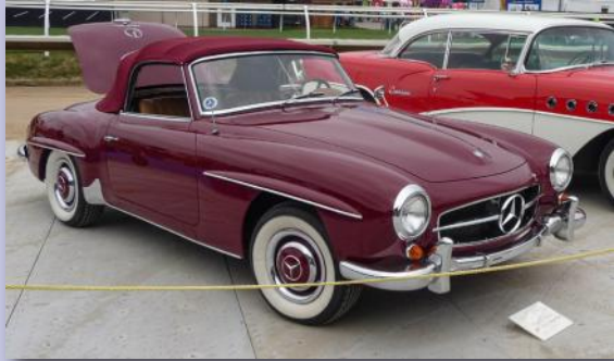
1961 Mercedes-Benz 190 SL Brian Kruse