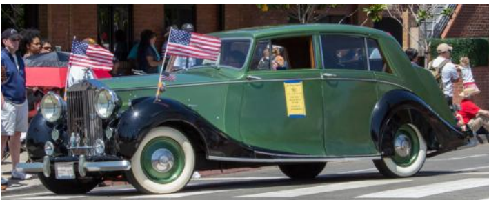
Al Smithson 1948 Rolls-Royce Silver Wraith saloon