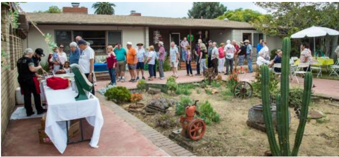
The phrase "food is ready" and immediately there is a line