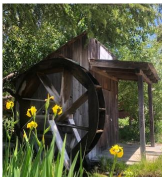
Mom's Pie House