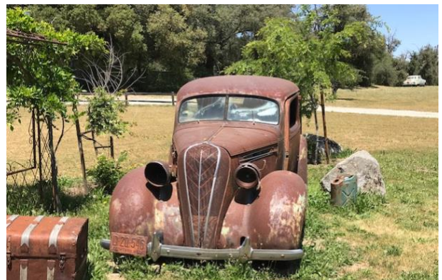
The Barn Vintage Marketplace