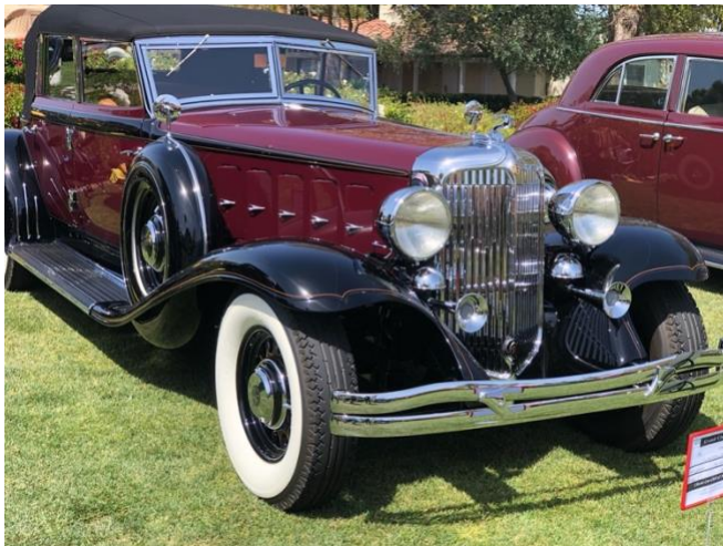
My show favorite, a '33 Duesenberg sedan