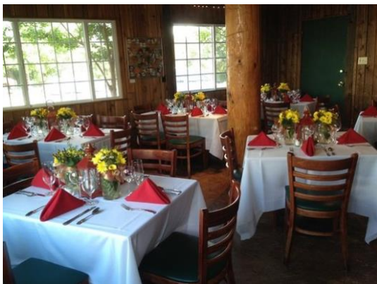
Wynola Pizza and Bistro