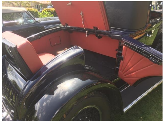
Nick's cars are parked just past a '41 Cadillac on the lawn. The '29 Sport Roadster has an unusual walk-in rumble seat.