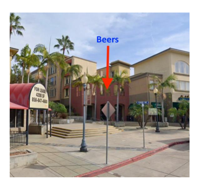
3900 Vermont St, Hillcrest

Some events, like the Hillcrest Car Show, have standard times and locations. Others require directions. Again, watch the Foot Warmer for details, and join in with the general meetings. See the Activities FAQ, next page.