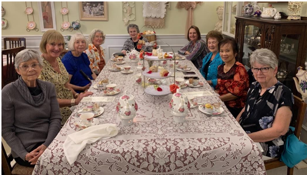
AACA women enjoyed a delightful tea and lunch at the Grand Tea Room in Escondido. More on page 6.