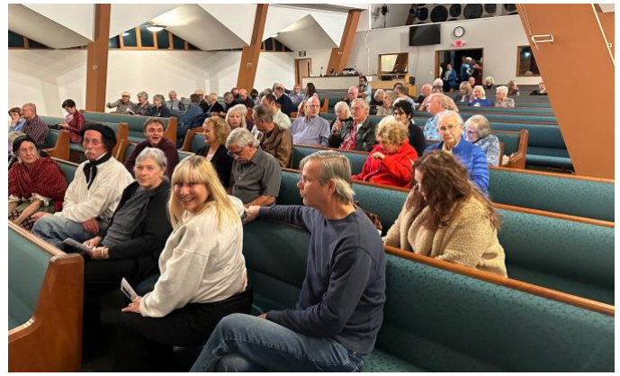
A happy audience anticipates a great Silent Movie!