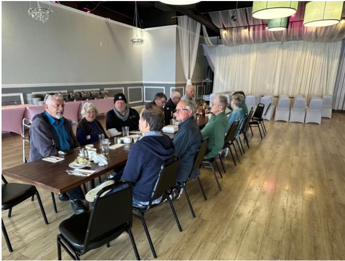
Elijah's gave us our own room for the breakfast social!

The monthly regional breakfast was held at Elijah's Restaurant on Claremont Mesa Drive, just east of the 805. Elijah's puts on a great spread, notably including lox and salmon and potato lotkes. Several styles of eggs Benedict as well! Plenty of coffee, separate checks with no objection, good food, reasonable prices – what's not to love? Sounds like we will be back next month!