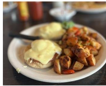
Elijah's Eggs Benedict