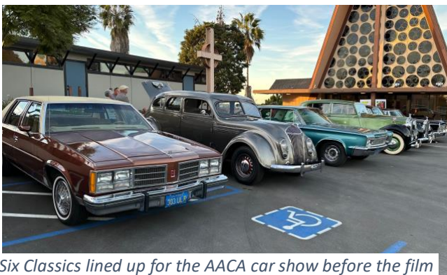
Six Classics lined up for the AACA car show before the film program