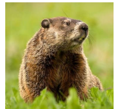
Happy Groundhog Day!