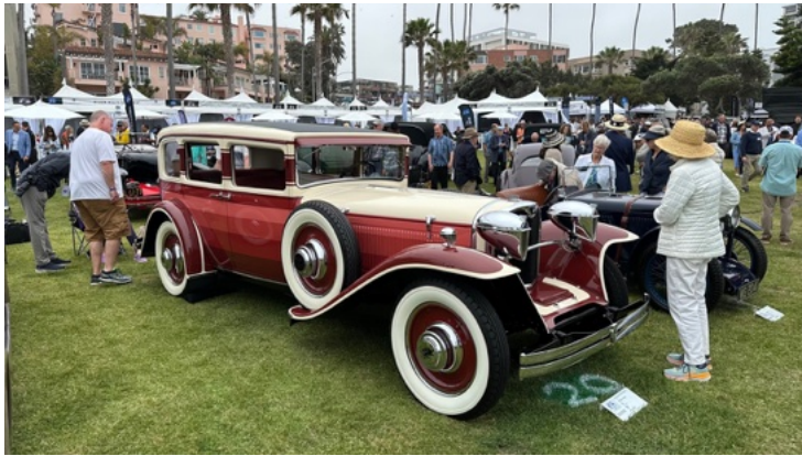
The Nethercutt Collection's 1930 Ruxton