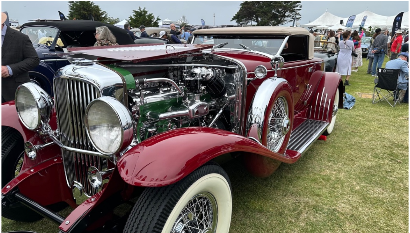
IWC TIMELESS ELEGANCE AWARD 1930 Duesenberg Model J