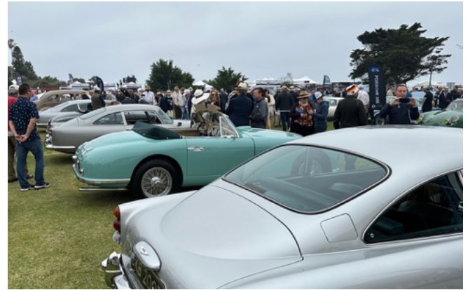
The Aston Martin display