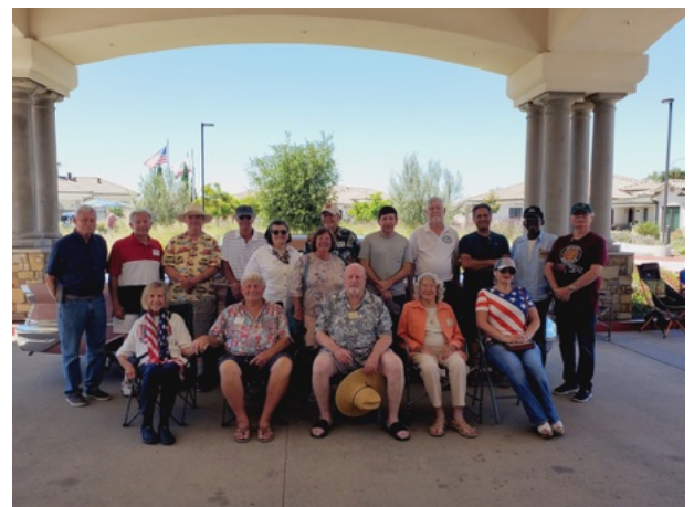
2023 Silvergate car show