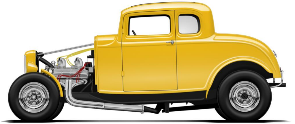
J.M. FORD DESIGNS