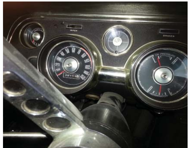
38,113 original miles