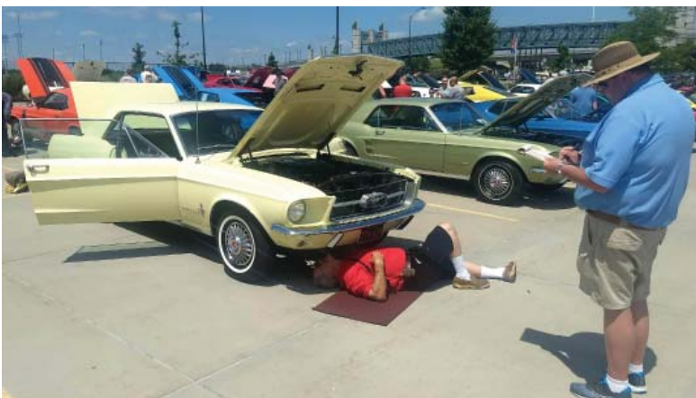
Judging at MCA National Show in Lincoln, Nebraska