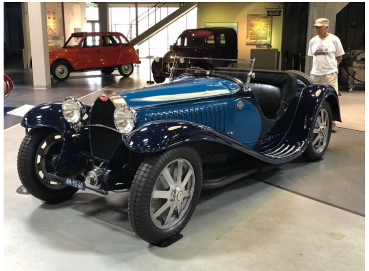
1932 Bugatti Type 55