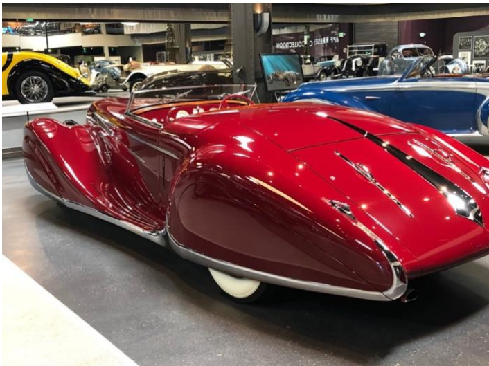
1939 Delahaye 165