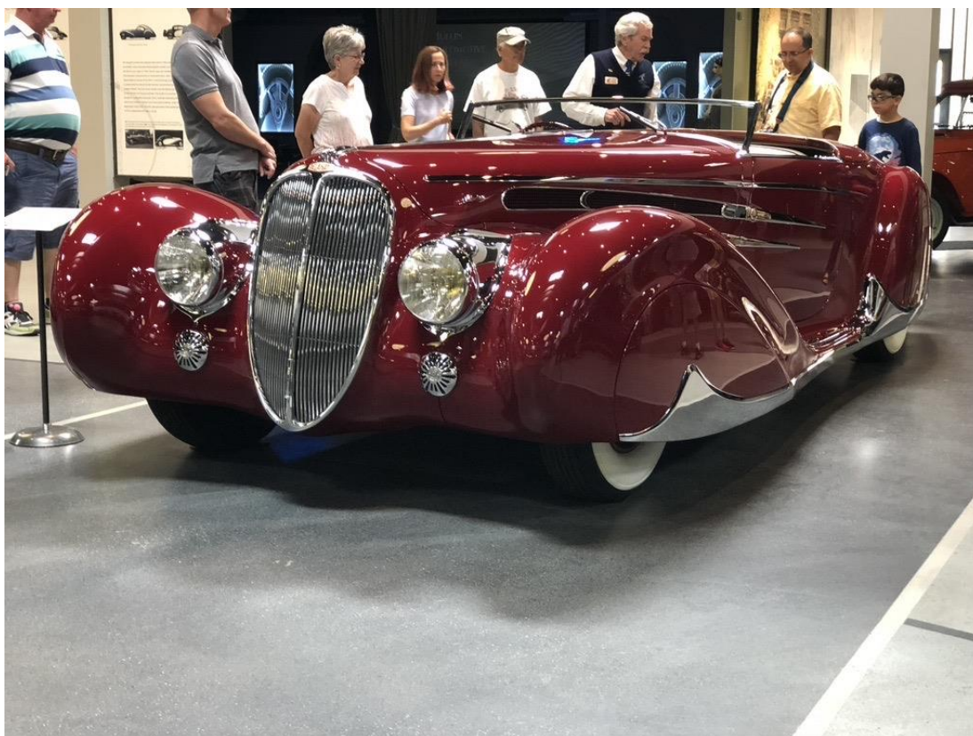
Mullin Museum News (see page 6)

The Foot Warmer is the approximately monthly newsletter for the San Diego Region, AACA. Member submissions are solicited, welcomed, encouraged – all of that! Please email articles and photos of your antique automobiles and related activities to the editor at drjohn96@mac.com .