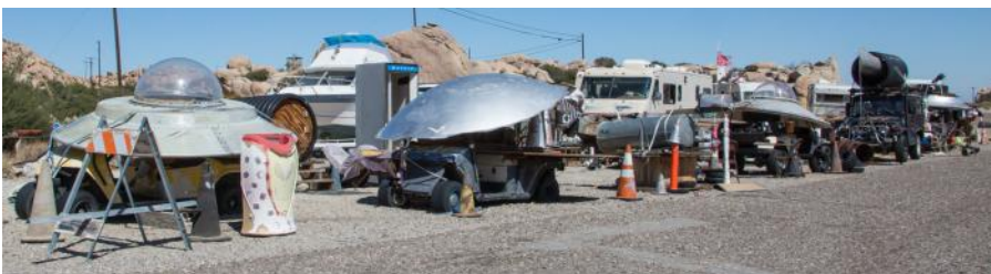
Where would we be without this Flying Saucer repair facility?