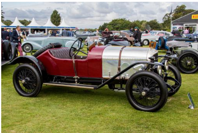
This is the VERY first Bentley