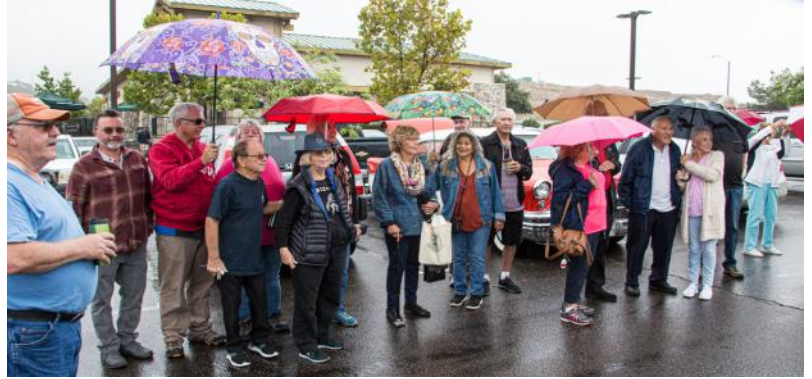
Nothing like a cold shower to get things going in the morning