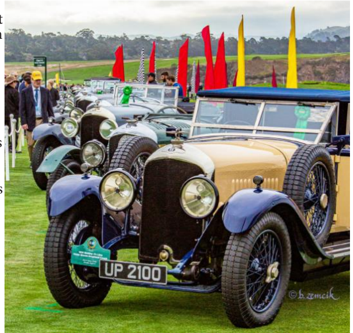
The Vintage Bentley line up at Pebble Beach