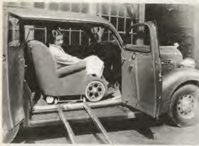
Invalids find that riding becomes a pleasure in this new wheel chair. It slides into the car on rails after the center post has been removed. The rails are carried on the bumper.

THE difficulty encountered by permanent or convalescent invalids in getting in and out of automobiles led to the much needed invention of a removable invalid's chair for automobile installation.