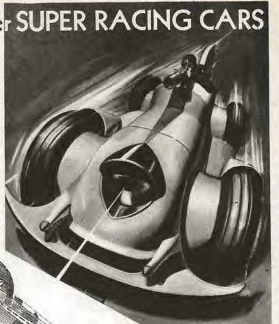
The driver of the proposed super-speed racer can make movie record of car's performance. After starting, and putting it into motion he leaves driving responsibilities to the mechanical and electrical brain.

Speeds never before attained on land may become a reality if experiments with light beam, driverless cars are successful. Here are the mechanical features that will be involved.