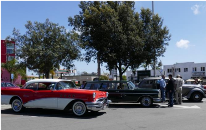
San Diego cars arrived early and got the best places.

Another beautiful day in Hillcrest for the Great Autos Car Show, third Saturday of each month. Laid back, casual car show. Time to visit, time to inspect, time to get lunch. You should come next month!