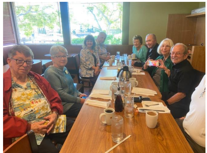
4th Saturday breakfast. See page 6.