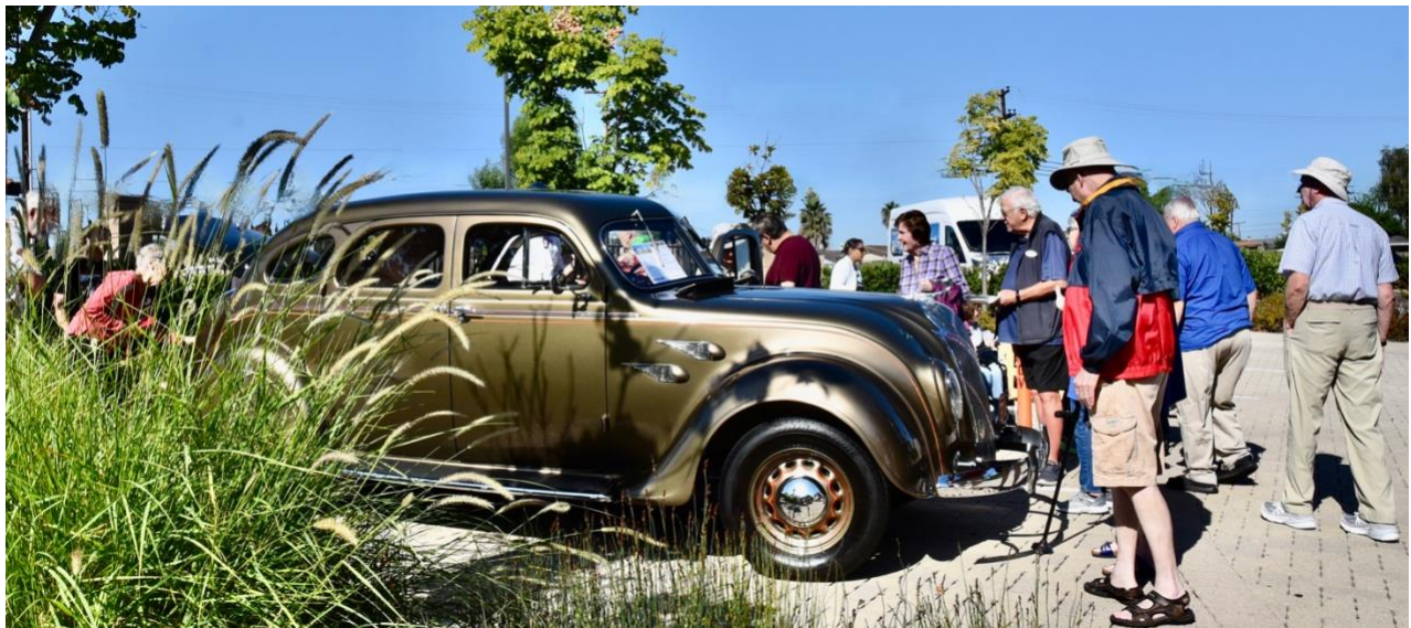
Mount Miguel residents gathered around the author's 1936 DeSoto asking questions and telling stories of other DeSotos they had known.