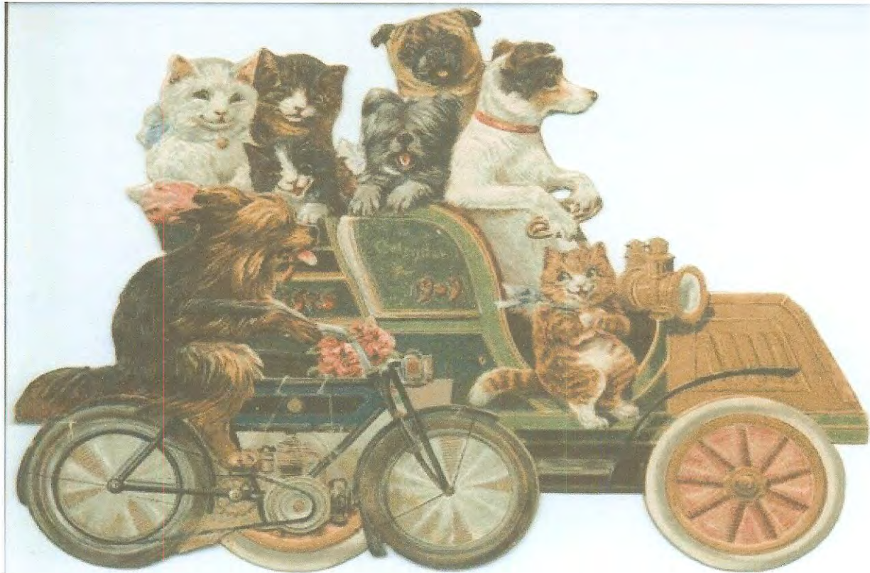
An Old Postcard for Christmas 1909. I hope you had an enjoyable and blessed Christmas!!!