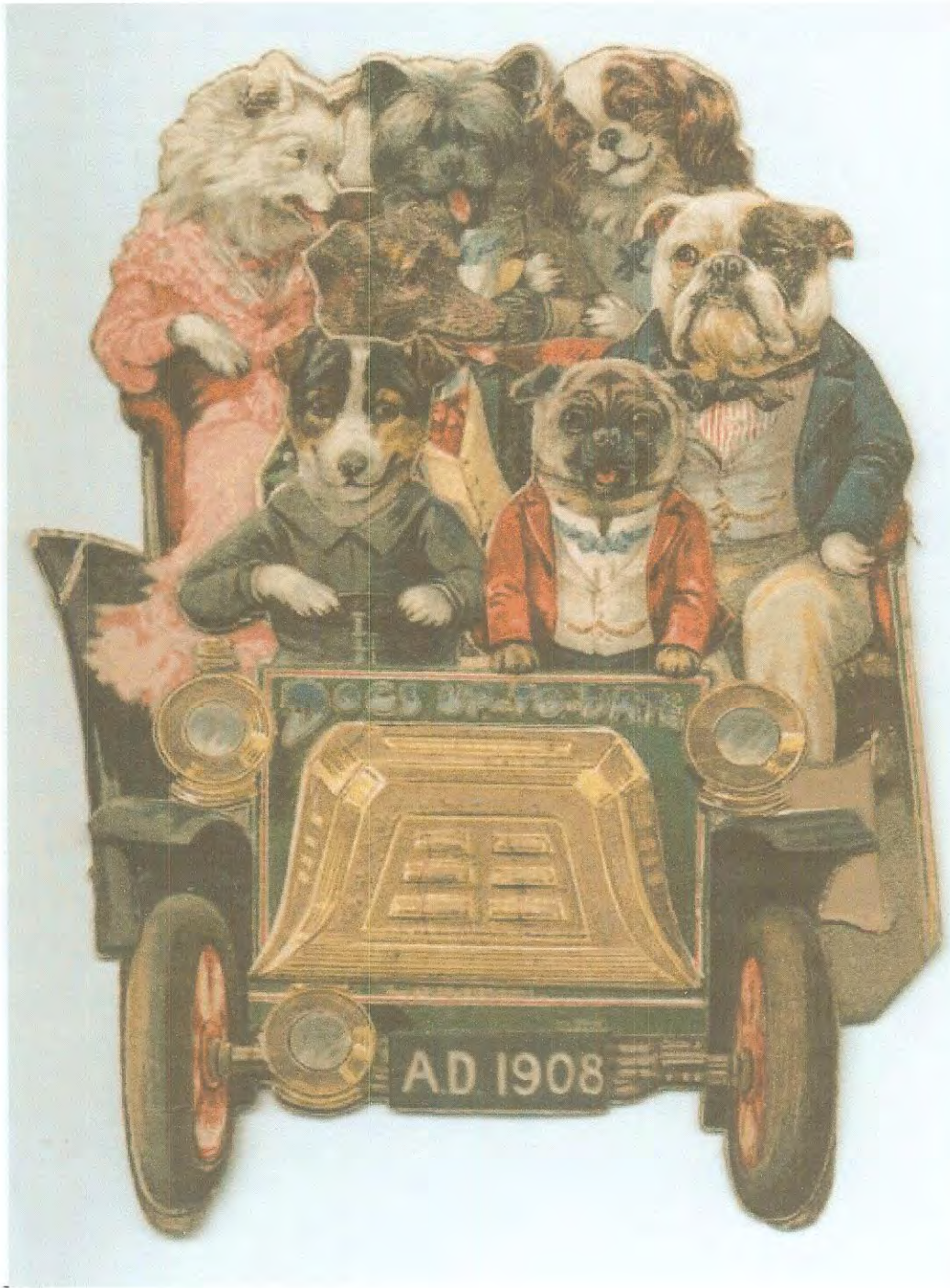
An old postcard for New Year 1908. Happy New Year. Have a prosperous and fun 2024!!!