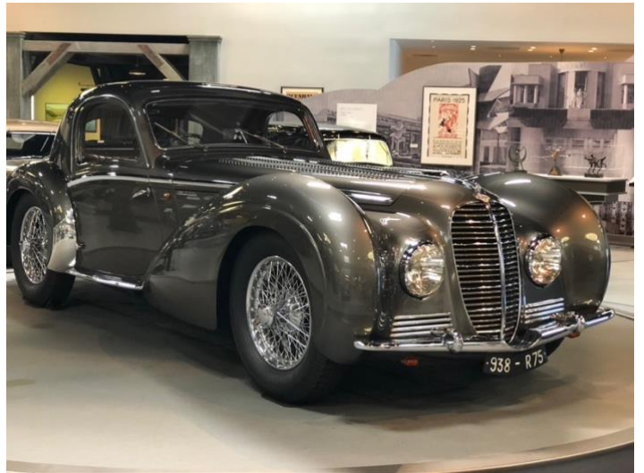
1937 Talbot-Lago T150-C-SS