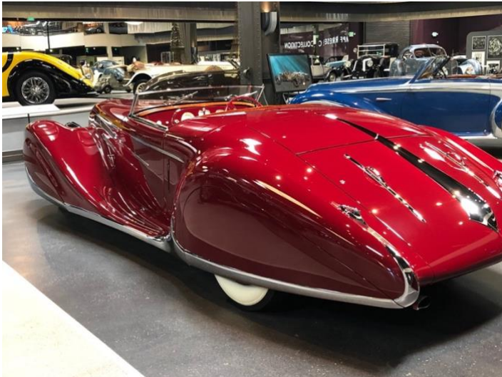
1939 Delahaye 165