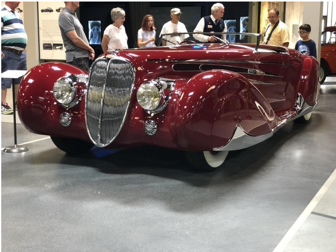
Mullin Museum News (see page 6)

The Foot Warmer is the approximately monthly newsletter for the San Diego Region, AACA. Member submissions are solicited, welcomed, encouraged – all of that! Please email articles and photos of your antique automobiles and related activities to the editor at drjohn96@mac.com .