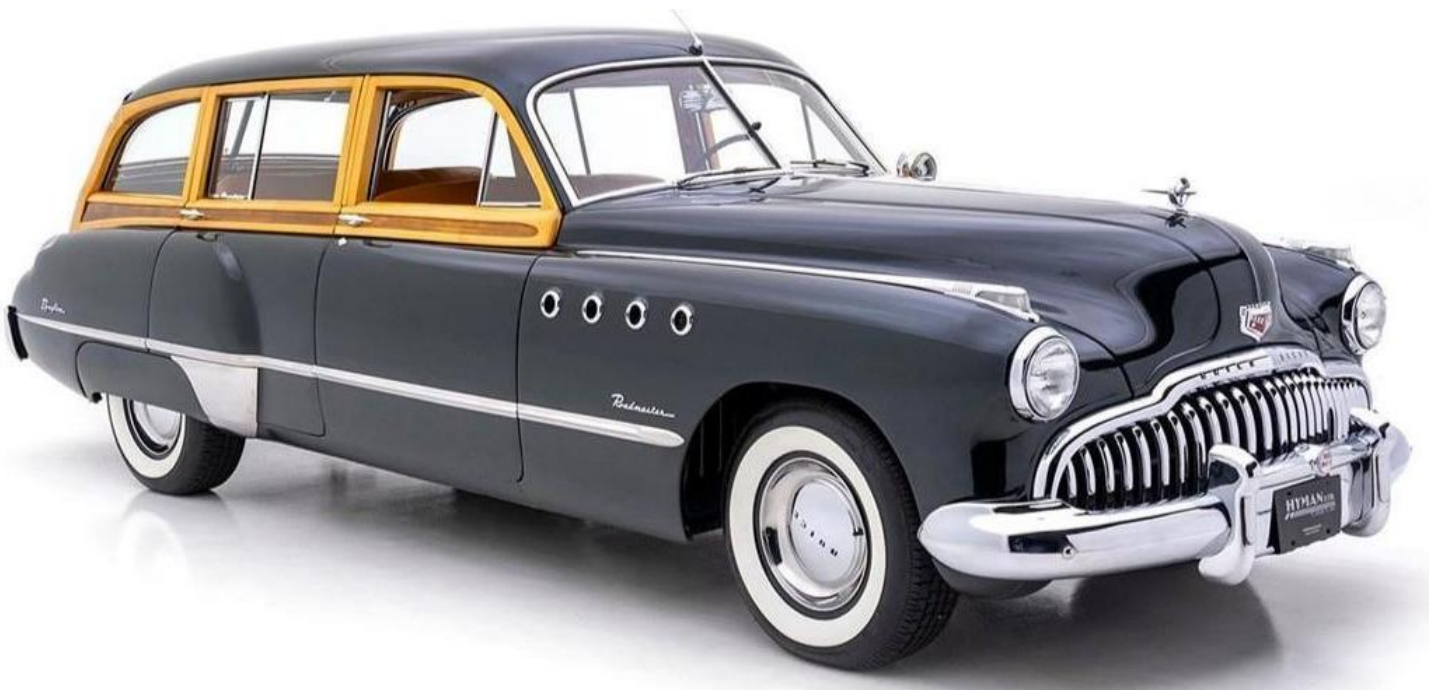
A lovely 1949 Buick Roadmaster just listed for sale in St. Louis, Asking $149,500.