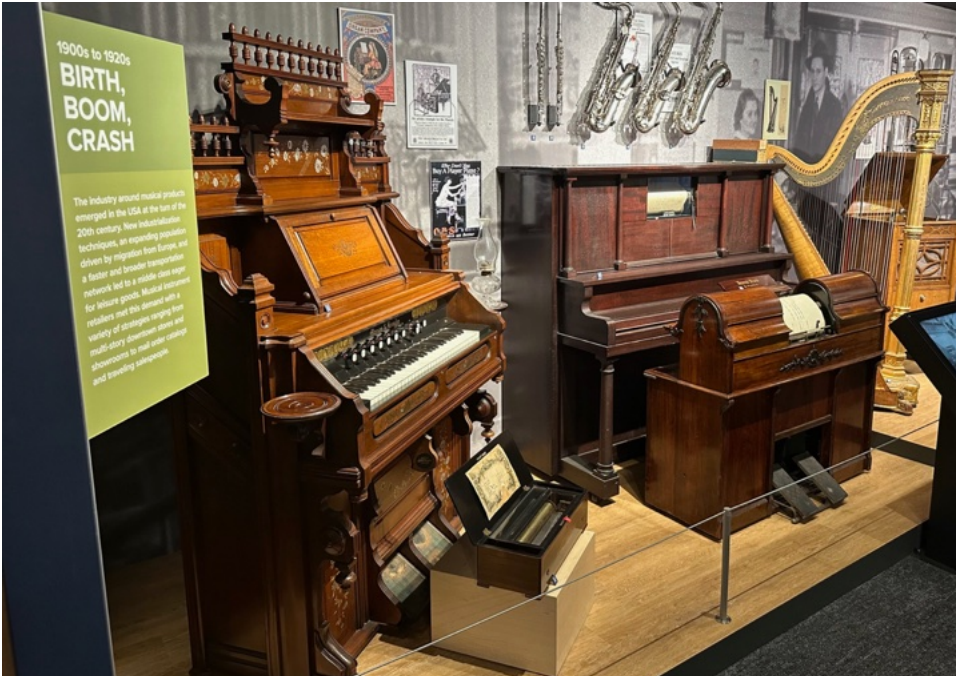
Top left: A collection of glass flutes and early electric instrument equipment. Left, How we made music before radios, television, and hi-fi. Above: The first Taylor guitar. The now famous and popular Taylors are made in El Cajon, and many of us have participated in their Friday open house tours.