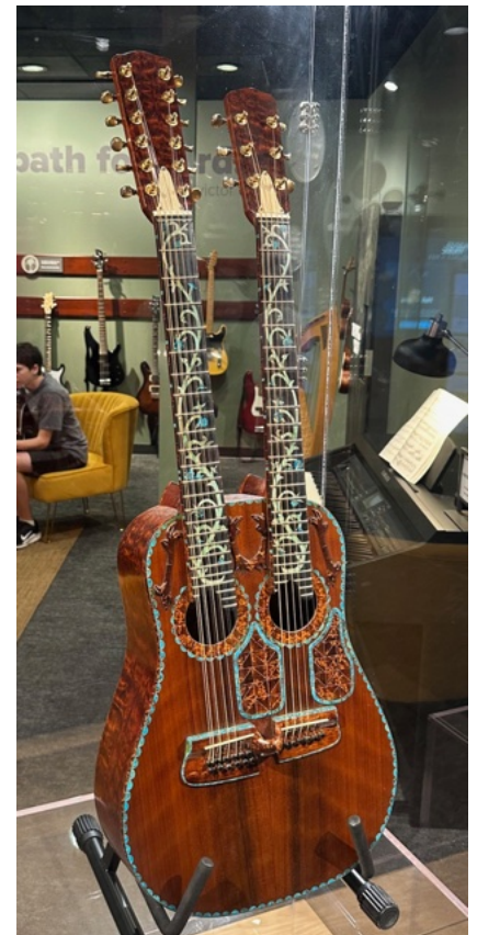
A multifunction 6-string and 12-string guitar

The day concluded with a wonderful group lunch at the nearby Islands Restaurant, where we enjoyed their famous large portions of tropical-themed treats. Sincere thanks to the Jurists for their hard work in organizing and leading another successful driving tour!